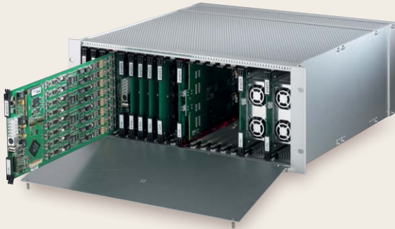
Matrix Frame MF4